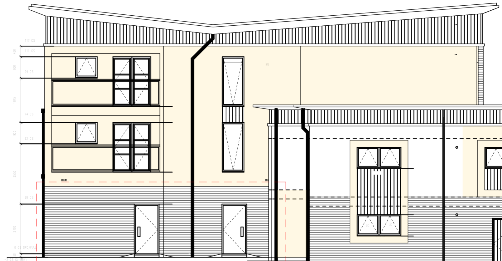
Elevation B - Rear Elevation Scale 1:100