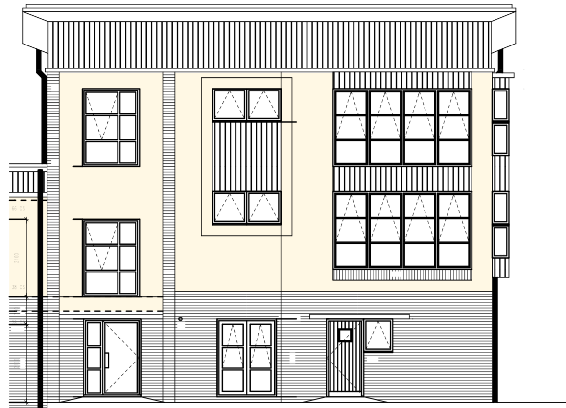
Elevation A - Side Elevation Scale 1:100