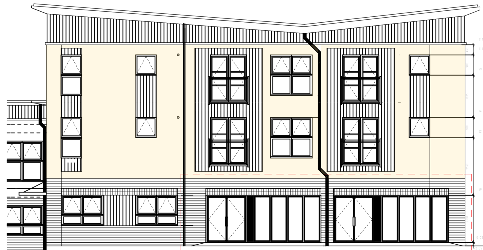
Elevation D - Frontage Elevation Scale 1:100